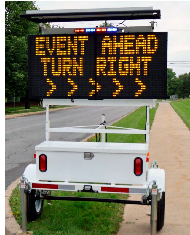
Flock-ready trailer with SpeedAlert 24 radar message sign and Flex LPR camera

Trailers are compatible with our InstAlert variable message signs and SpeedAlert radar message signs so you can share messages, reduce speeding, or collect traffic data while covertly capturing license plates.