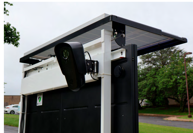
Cameras attached to rear mounting plate