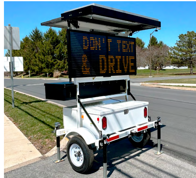
SpeedAlert 24 radar message sign on 380 LPR camera-ready trailer with two-camera enclosure box

Trailers are compatible with our InstAlert variable message signs and SpeedAlert radar message signs so you can share messages, reduce speeding, or collect traffic data while covertly capturing license plates.