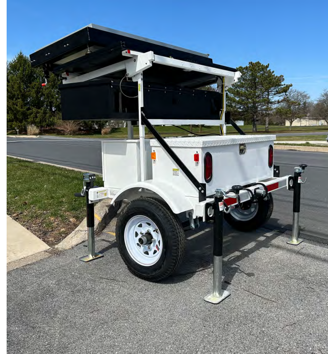
SpeedAlert 24 radar message sign folded down on 380 LPR camera-ready trailer