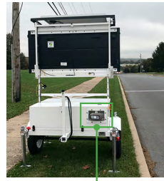
Recessed camera compartment option