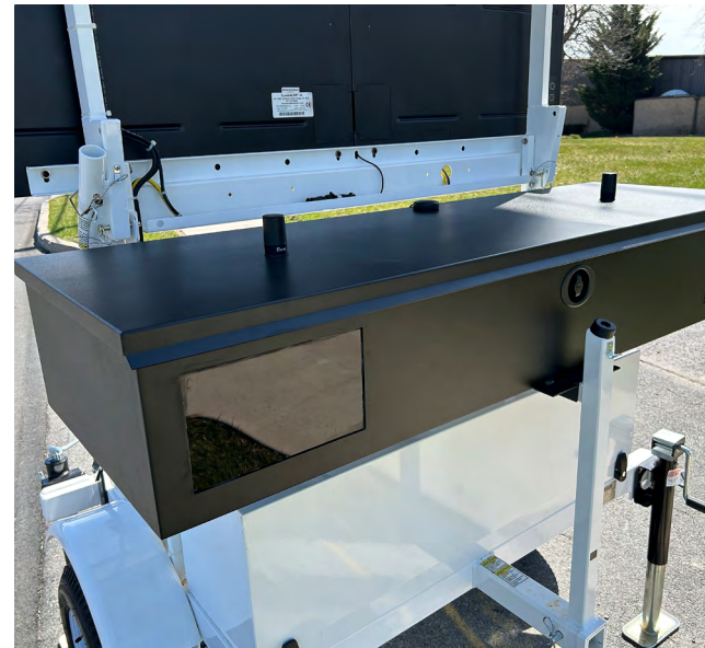
Customizable two-camera enclosure box