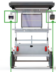
Crossbar mounting option