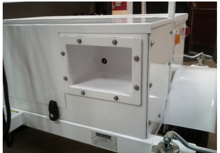
Optional recessed camera compartment

For more information visit us online at AllTrafficSolutions.com