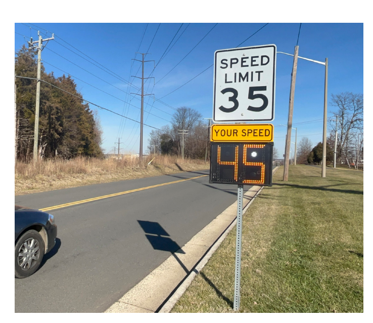
Shield 15 radar speed sign

They're shatterproof, graffiti-resistant, and can withstand 150-mph winds and inclement weather such as ice, snow, and heavy rain.