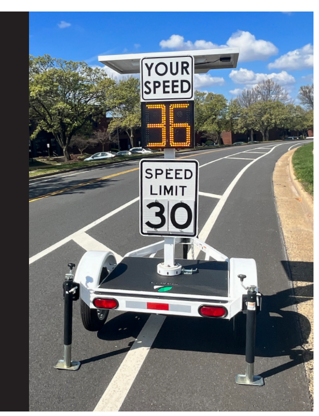
Shield 12 with optional white compact 'YOUR SPEED' sign on an ATS 3 trailer