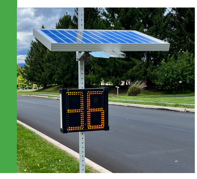
Shield 12 with integrated solar power