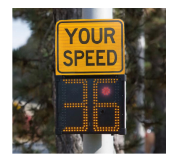
Optional Violator Alert. Available in blue, red, or white