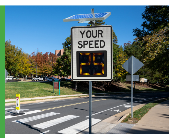
Shield 12 with white full-size 'YOUR SPEED' sign wrap