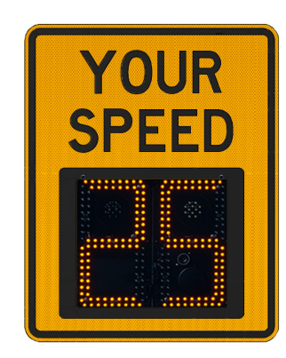
Optional full-size 'YOUR SPEED' sign wraps