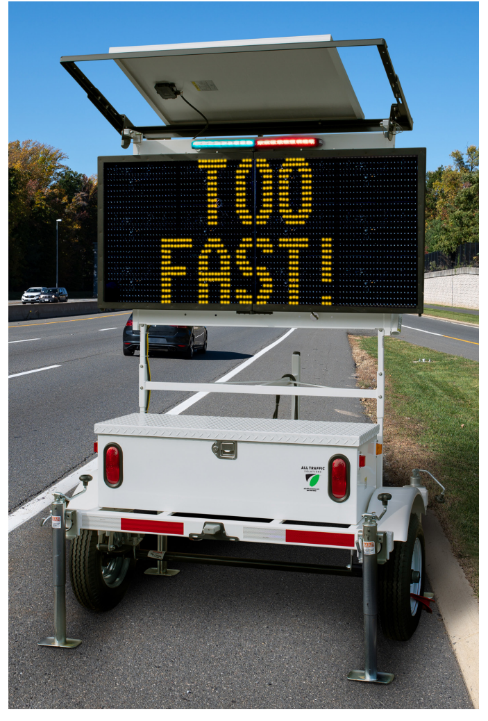
SpeedAlert 24 on an ATS 5 trailer

The ultra-portable SpeedAlert 24 can fold in half and is easily deployable by one person on a trailer, portable post, pole, or vehicle hitch. The trailer is lightweight and easy to maneuver, so you can take it wherever you need traffic calming or roadside messaging.