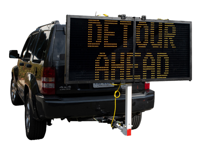
SpeedAlert 24 on a vehicle hitch