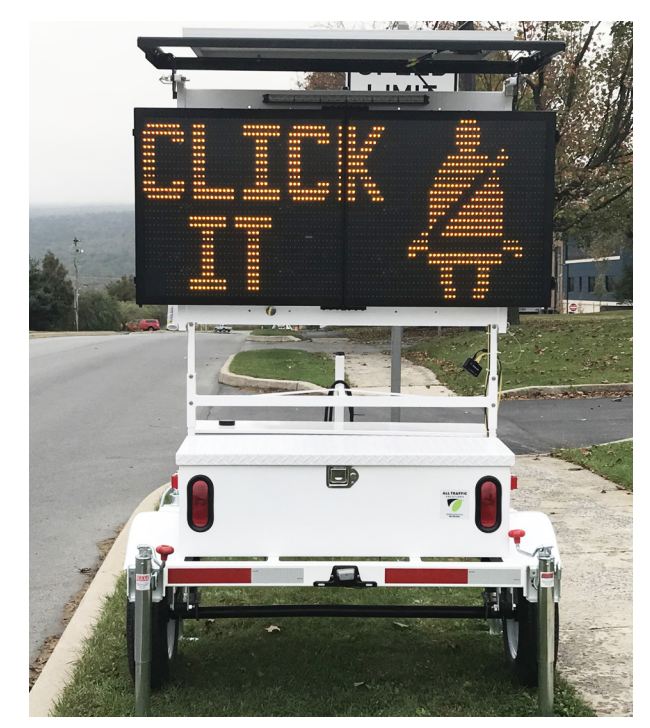
SpeedAlert 24 on an ATS 5 trailer