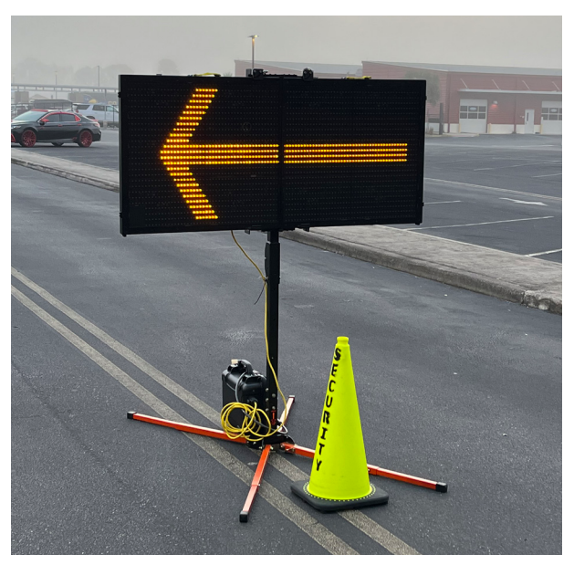
SpeedAlert 24 on a portable post