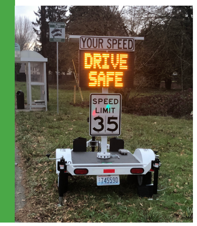
Optional white compact 'YOUR SPEED' sign