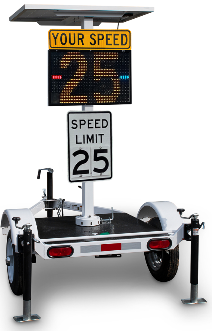
SpeedAlert 18 on an ATS 3 Trailer