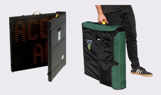
InstAlert 24 folds for easy transport

2 lines: (1) 7" characters, 12/line, (1) 10.25" characters, 8/line