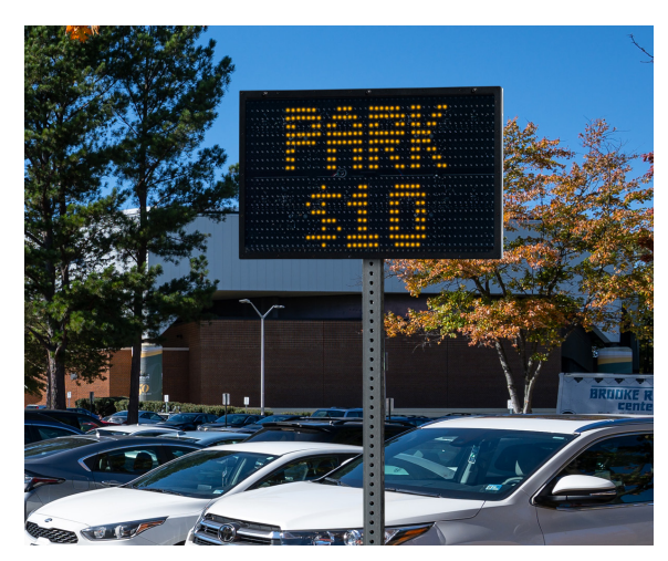
InstAlert 18 on a pole