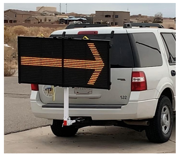
InstAlert 24 on a vehicle hitch