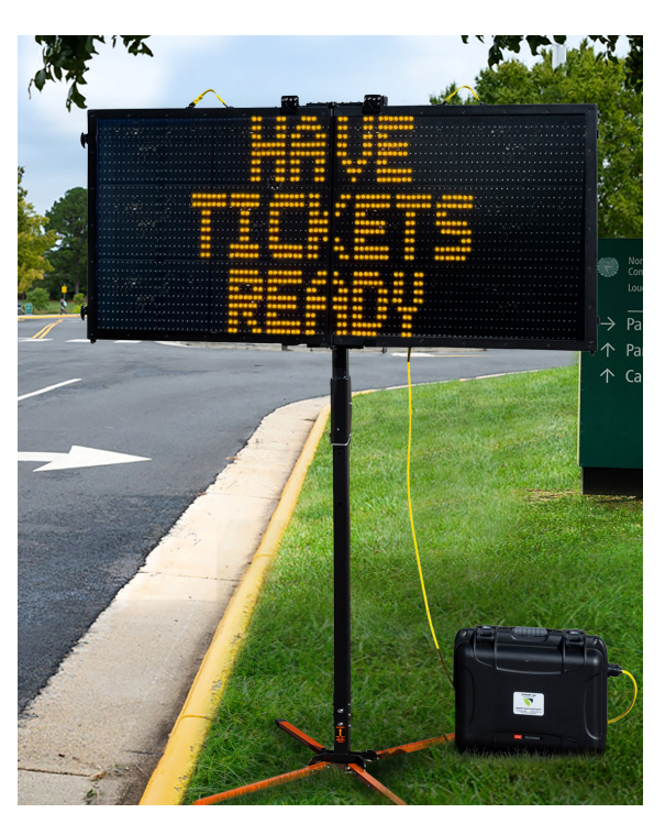
InstAlert 24 on a portable post