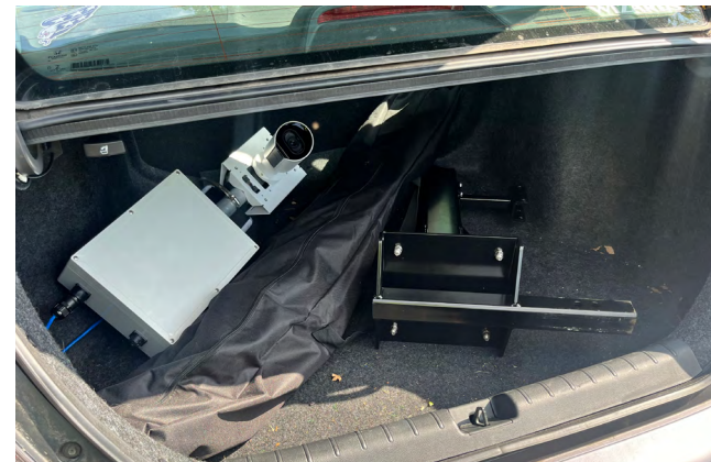
Detachable mast compacts down and all components fit in the trunk of a car