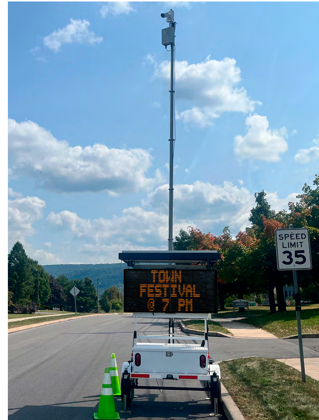
Surveillance-ready trailer with mast attached

Get alerted** via text message or email when a trailer's sign is tampered with or when its power runs low.