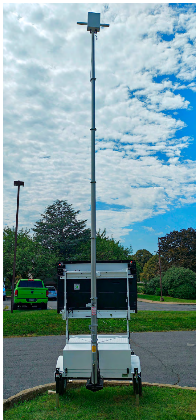
Rear view of trailer with mast attached to hitch