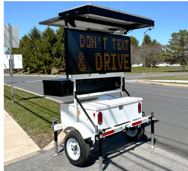
SpeedAlert 24 radar message sign on 380 ALPR camera-ready trailer with two-camera enclosure box

Trailers are compatible with our InstAlert variable message signs and SpeedAlert radar message signs so you can share messages, reduce speeding, or collect traffic data while covertly capturing license plates.