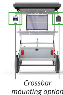
Crossbar mounting option