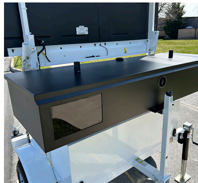
Customizable two-camera enclosure box