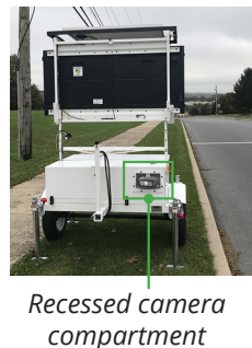
Recessed camera compartment option