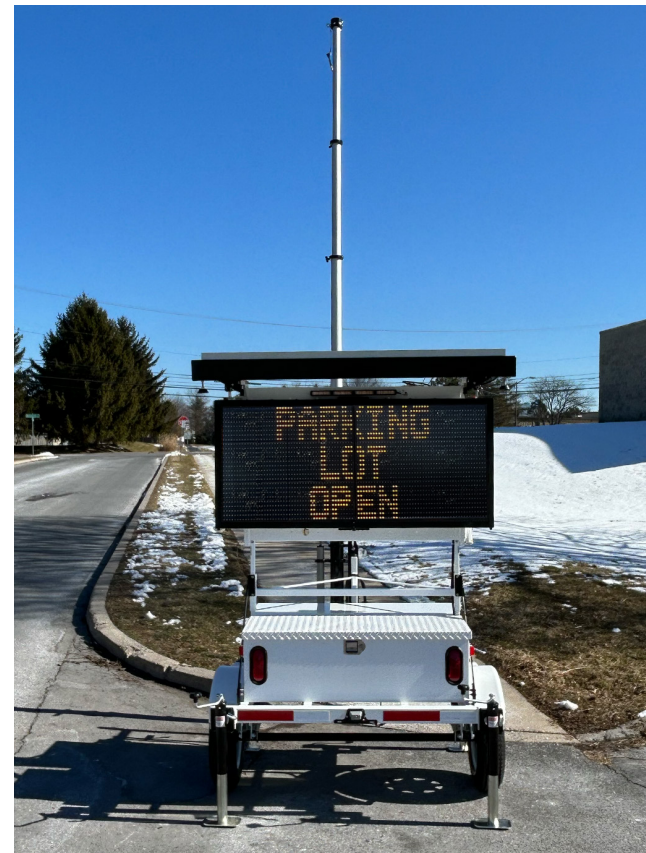
Surveillance-ready trailer with mast attached

Get alerted** via text message or email when a trailer's sign is tampered with or when its batteries run low.