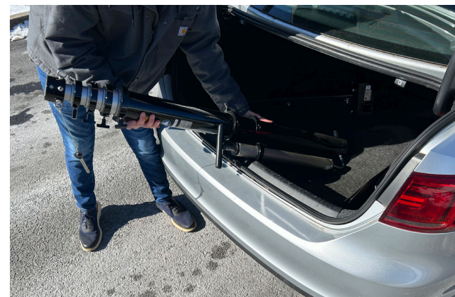
Portable mast fits in the trunk of a car when compacted down