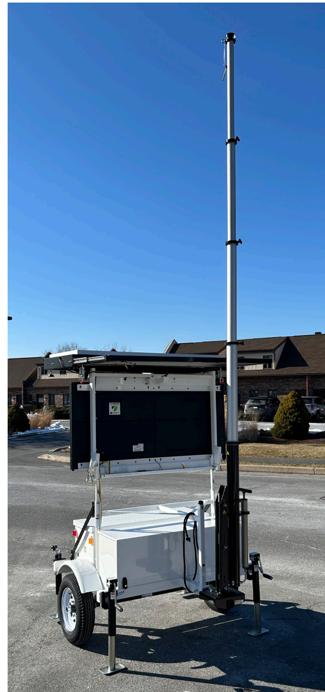
Rear view of trailer with mast attached to hitch