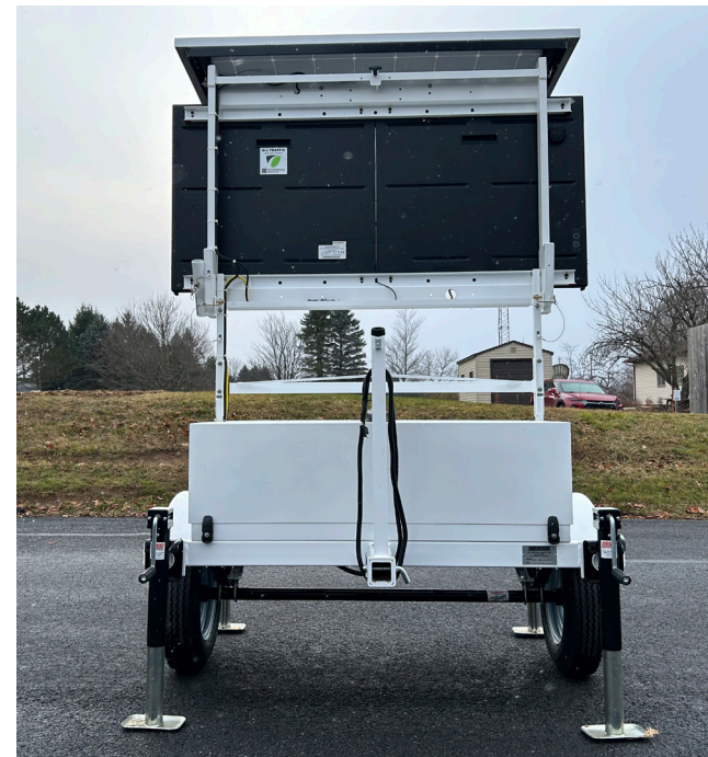
Back view of 190W ATS 5 FLEX Trailer