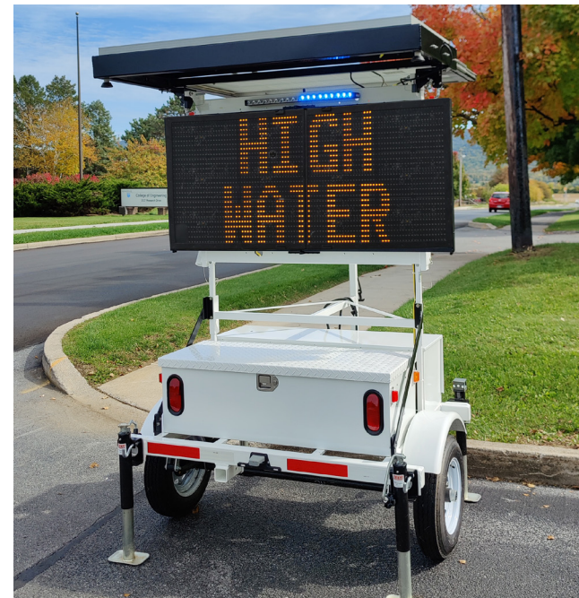
SpeedAlert radar message sign on a 380W ATS 5 FLEX trailer

Trailers are compatible with our InstAlert variable message signs and SpeedAlert radar message signs so you can share messages, reduce speeding, or collect traffic data while using your other equipment of choice.