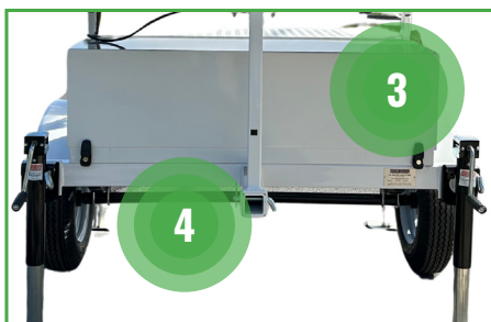
Rear view of trailer