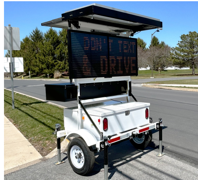
SpeedAlert 24 radar message sign on 380 ALPR camera-ready trailer with two-camera enclosure box

Trailers are compatible with our InstAlert variable message signs and SpeedAlert radar message signs so you can share messages, reduce speeding, or collect traffic data while covertly capturing license plates.