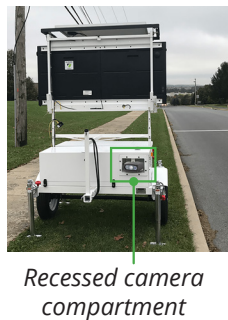
Recessed camera compartment option