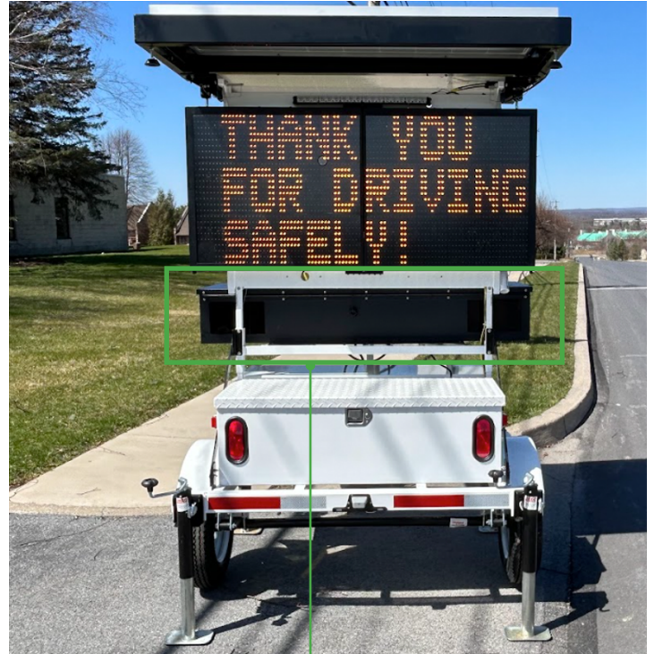
ELSAG M7 CAMERA SYSTEM IN CAMERA ENCLOSURE BOX

*TraffiCloud® software subscription required— contact us to learn more.