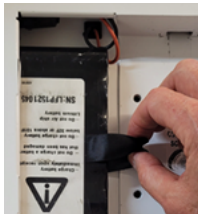
[Figure 2] Slide the battery