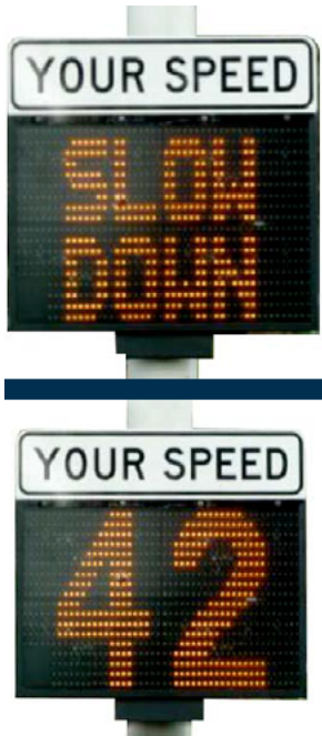
[Figure 1] SpeedAlert 18 Speed Sign

NOTE: If your purchase includes the Integrated Solar option, this guide DOES NOT apply to your product. Please refer to either the ATS 3 Trailer with Integrated Solar Setup Guide or Pole Mounting Signs with Integrated Solar Option that came with your sign and available on www.alltrafficsolutions.com .