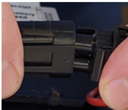
[Figure 2] Slide the battery [Figure 3] Disconnect/connect the battery