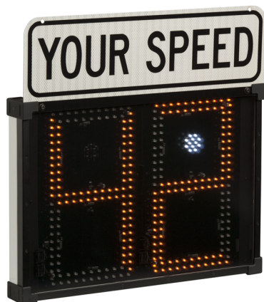
[Figure 1] Shield 15 Speed Sign

NOTE: If your purchase includes the Integrated Solar option, this guide DOES NOT apply to your product. Please refer to either the ATS 3 Trailer with Integrated Solar Setup Guide or Pole Mounting Signs with Integrated Solar Option that came with your sign and available on www.alltrafficsolutions.com .