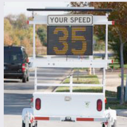
ATS Trailer: Deployed with SpeedAlert 24