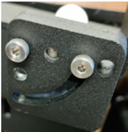
[Figure 2] Locking plate