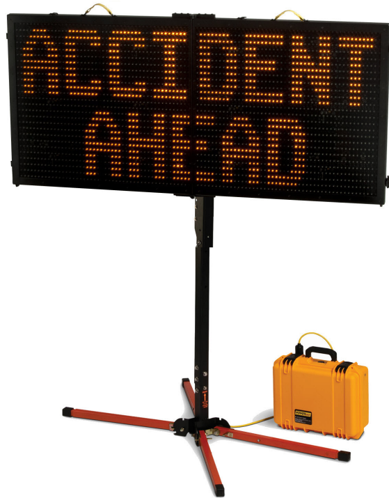
[Figure 1] InstAlert 24 with Portable Post and PowerCase

Thank you for purchasing an All Traffic Solutions InstAlert 24 Variable Message Sign. This hardware quick start guide will show you how to set up, power, and configure your new sign. For details about using the sign, go to www.alltrafficsolutions.com/support , where there are complete user manuals that you can use online or download and print.