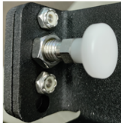
[Figure 3] Spring-loaded retaining pin