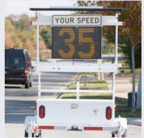
ATS Trailer: Deployed with SpeedAlert 24