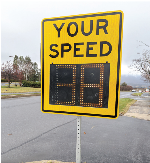
Shield 15 with yellow wrap