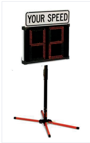
Shield 15 on portable post