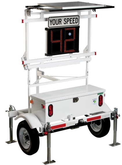
Shield 15 on ATS-5