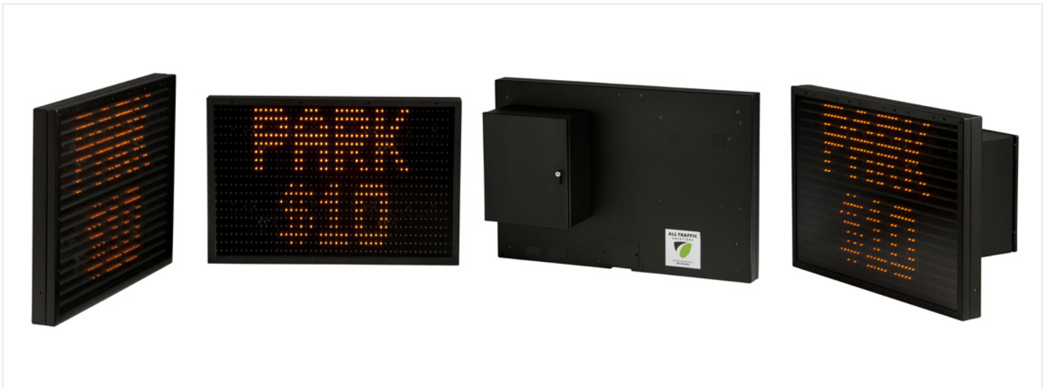
InstAlert 18 (Left to Right: Left Side, Front, Back and Right Side Views)