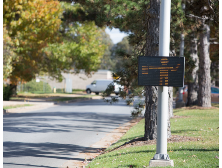
InstAlert 18 on ATS Trailer