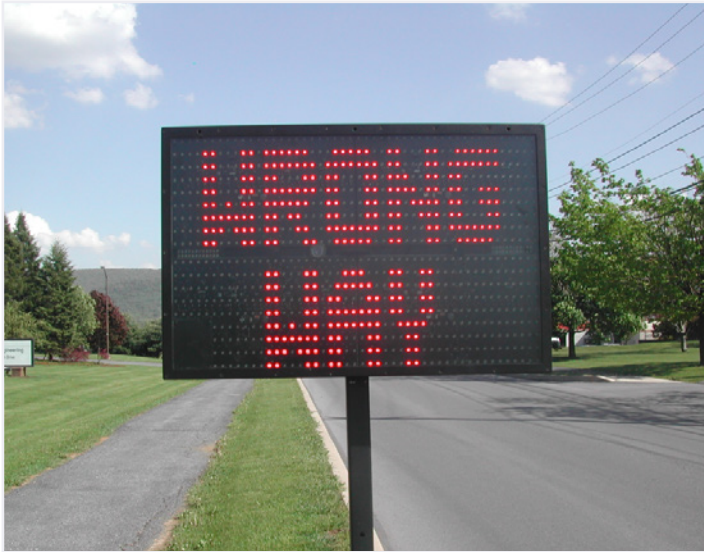
InstAlert 18 on portable pole