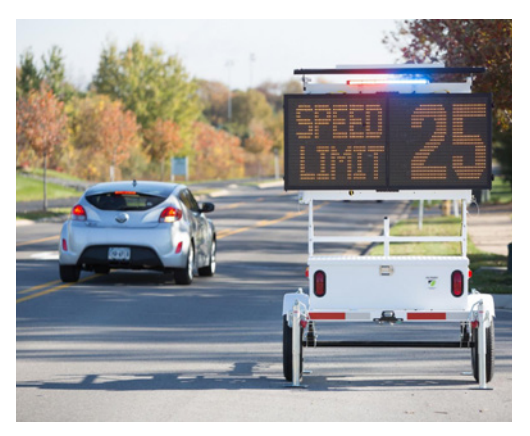
SpeedAlert 24 on an ATS 5 trailer