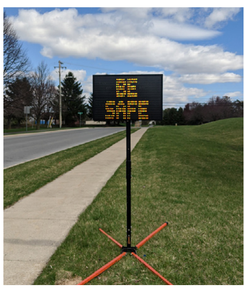
InstAlert 18 on a portable post