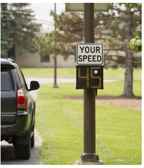
Shield 12 on a pole