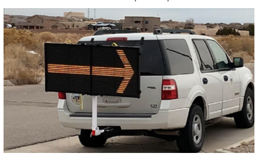
InstAlert 24 on a vehicle hitch