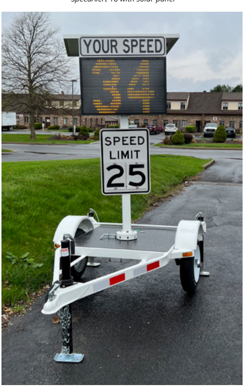
SpeedAlert 18 an ATS 3 Trailer