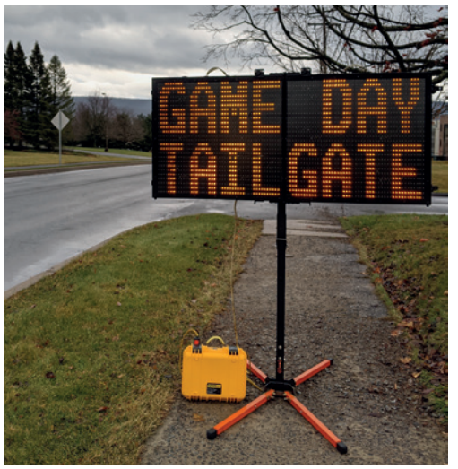
InstAlert 24 on a portable post