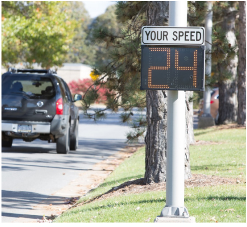
Shield 15 on a pole