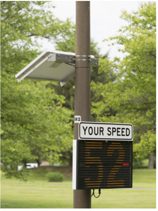
SpeedAlert 18 with solar panel