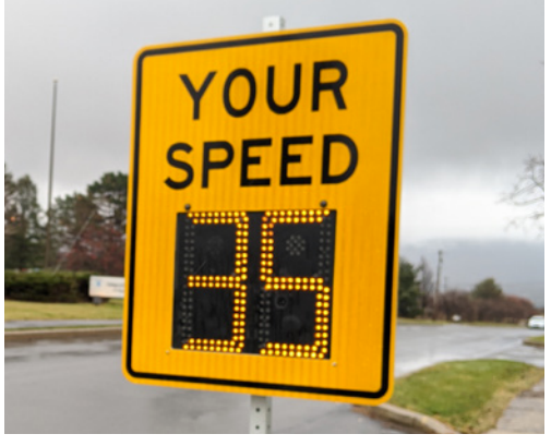
Shield 12 with yellow wrap