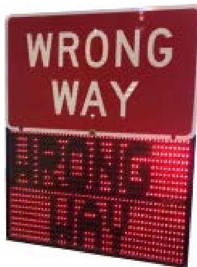
Integrates with existing transportation infrastructure

The QueTrak can also be mounted on an ATS 3 Trailer and solar powered.