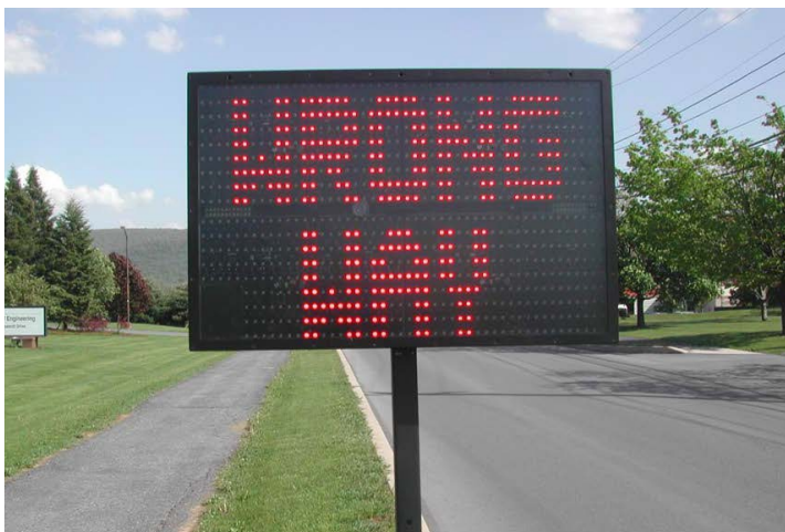
Signs can be deployed on portable posts or on trailers, or permanently mounted on poles

An optional confirmation sensor can be located after the message sign; if the vehicle continues past the sign, a signal is transmitted to the central controller to send an alert to the designated authorities.