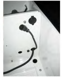
SPEEDsentry Power Cord – take out through hole in bottom of battery enclosure.