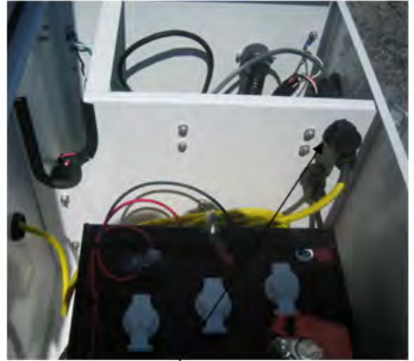
instALERT Power Plug in Battery Enclosure

Message sign power cord is routed into the battery compartment. It is plugged into the mating receptacle to turn the power on or off. Line up the word insert on the plug with the triangle on the receptacle. Insert the plug and turn to lock.