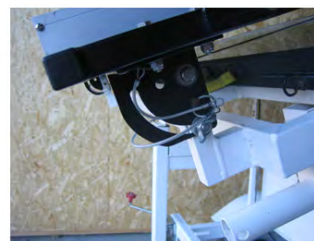
Solar panel pins and wing nuts

If the trailer has the solar power option, raise the solar panel before raising the sign. Loosen the wing nuts and remove the pins that hold the solar panel the stowed position, rotate the panel and reinsert the locking pins with their spring pins. Retighten the wing nuts to hold the panel in the raised position.