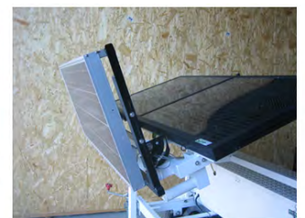
Solar panel deployed