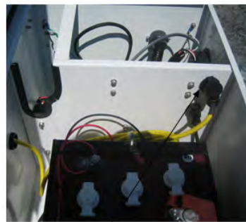
instALERT Power Plug in Battery Enclosure

On older units, plug the instALERT or SpeedAlert power plug into the receptacle in the trailer. O