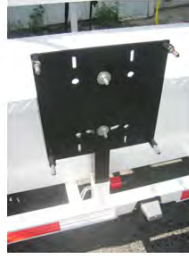
SPEEDsentry Mounted to Plate with Power Cord Attached

The trailer battery cable connects to the receptacle on the bottom of the Speedsentry unit. The Speedsentry can only be mounted on the accessory post on the trailer bumper for use in the dependent message system with the instALERT message sign. The Speedsentry will not fit in the trailer's primary display position.