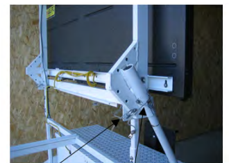
Display Lock Pin