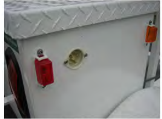
Charger plug, 120VAC only

To charge the trailer batteries, connect a 120VAC supply to the external AC plug on the battery enclosure. The red light on the charger indicates charging in process, and the green light indicates a full charge.