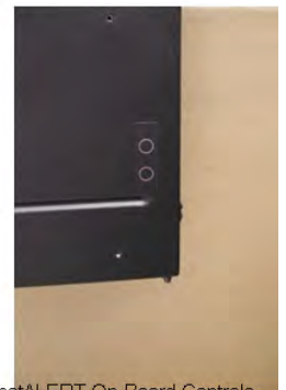
instALERT On-Board Controls on the back of the instALERT