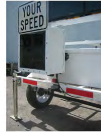
SPEEDsentry Mounting Plate on Post held in with Locking Hitch Pin