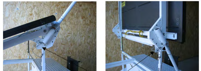
Display Lock Pin

Place the closest holding pin into the locking holes. Once this pin is in place, insert the pin on the other side of the trailer. If it is desired to lock the display in the raised position, place a padlock through the second hole in the holding pin bracket. When lowering, remove the pin on the far side of the trailer from the raising bar first. Then remove the pin on the side with the raising bar while holding the raising bar.