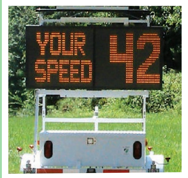
SpeedAlert 24 speed trailer

SpeedAlert web-enabled radar message signs combine radar feedback and variable messaging to deliver the most versatile traffic calming tools available.