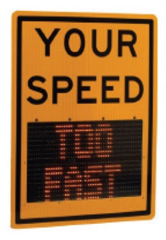
SpeedAlert 18 with and without wrap