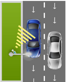
Unidirectional – Two incoming lanes with unit mounted on the side.