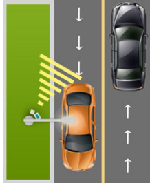
Bidirectional – One incoming/ one outgoing lane with unit mounted on the side.