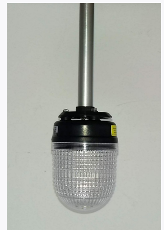
LED INDICATOR BEACONS