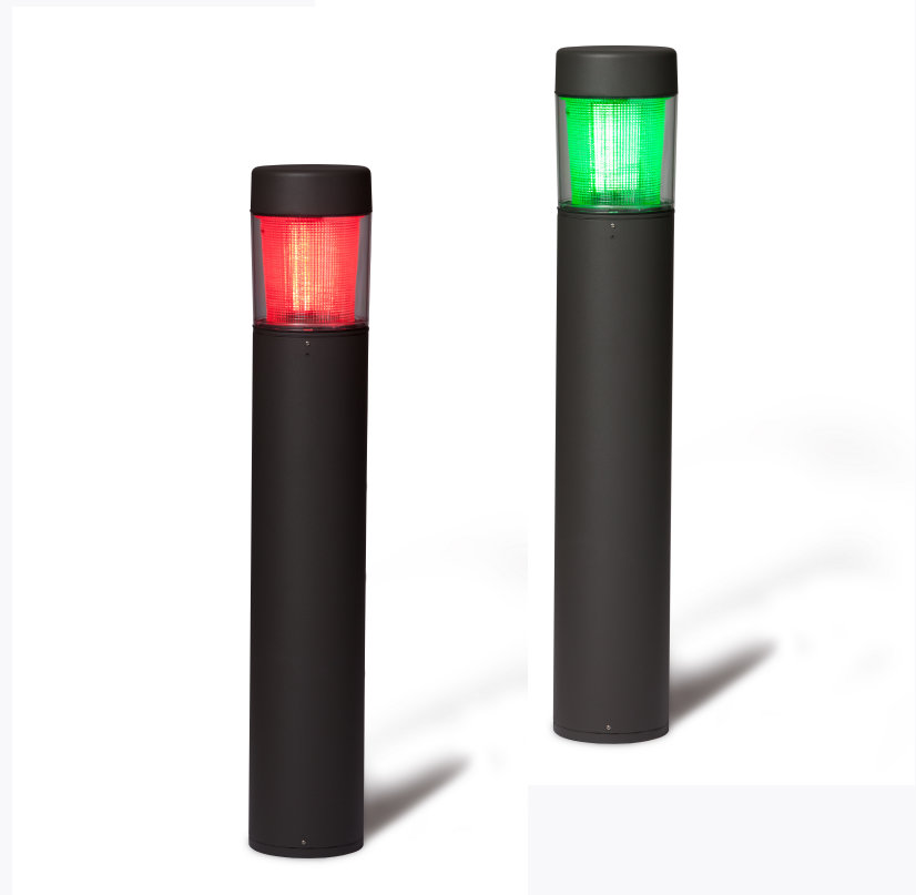
LED INDICATOR BOLLARDS