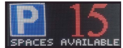
Parking Available Messaging