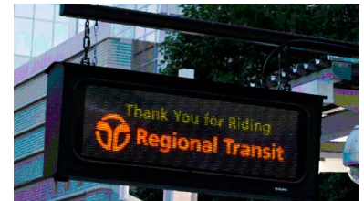
Full Matrix Color VMS