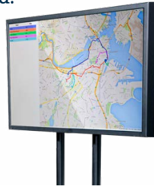
Virtual Drive Times