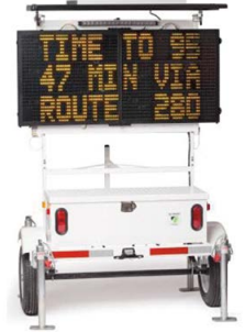
ATS 5 Trailer