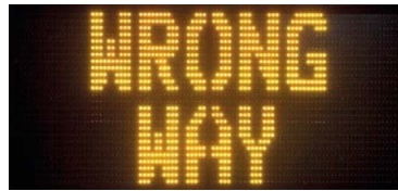
Wrong Way Detection