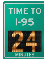
Time to Destination