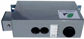
Vehicle Counting Systems