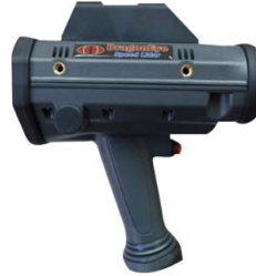
DragonEye Speed Lidar