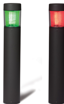
LED indicator bollards display red or green depending on space availability

The sign, however, was small, and more importantly only conveyed availability at the lot level. With sixty to seventy rows per lot, the information was not specific enough to expedite the parking process as adequately as the firm needed.