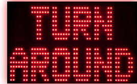
Red LED VMS displays