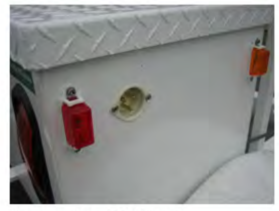
Charger plug, 120VAC only

To charge the trailer batteries, connect a 120VAC supply to the external AC plug on the battery enclosure. The red light on the charger indicates charging in process, and the green light indicates a full charge.