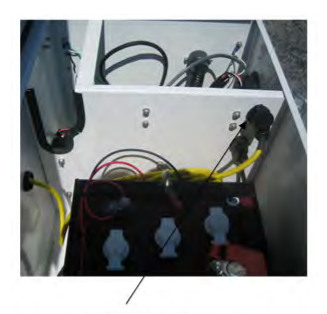
instALERT Power Plug in Battery Enclosure

Message sign power cord is routed into the battery compartment. It is plugged into the mating receptacle to turn the power on or off. Line up the word insert on the plug with the triangle on the receptacle. Insert the plug and turn to lock.