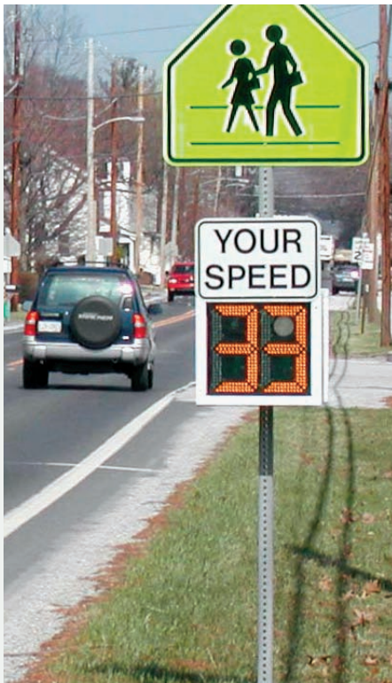
Product shown: SPEEDsentry